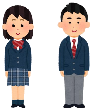
<blazer> <blazer> <skirt> <skirt>

In case of high schoolers, some schools choose blazers for their students, and boys wear “zubon” and girls wear “skirts” with their jackets.